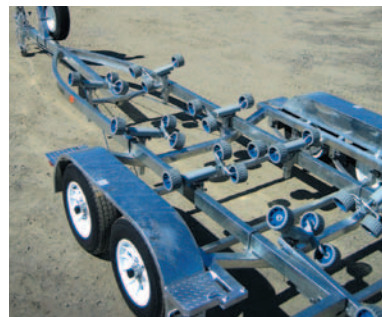
Tandem PU Multi-Roller Trailer

Trailer designs and specifications are subject to change